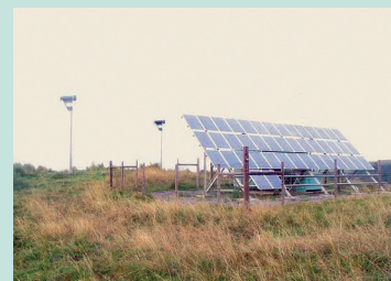
Figure 3: Vandalised PV panels at Hluleka Nature Reserve