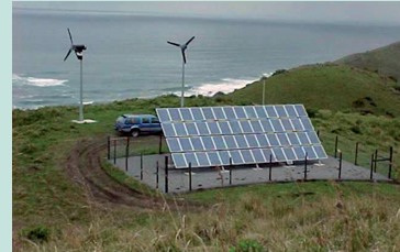
Figure 2: Renewable energy components of hybrid system at Hluleka Nature Reserve

Source: Ortiz et al. (2009) Potential for Hybrid PV Systems for Rural South Africa, in: Proceedings of Solar World Congress 2009: Renewable Energy Shaping Our Future.